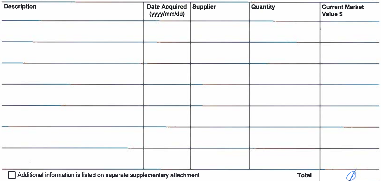
Table 4: Inventory of campaign goods and materials from previous municipal campaign used in this campaign (Note: value must be recorded as a contribution from the candidate and as an expense)